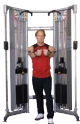
PEC FLY Vertical A-W