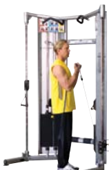
BICEPS CURL Vertical W