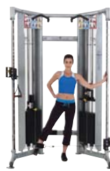
OUTER THIGH Vertical W