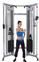
FOREHAND SWING Vertical I-P