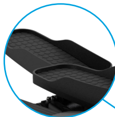
Soft Step Cushioned Anti-Fatigue Footpads