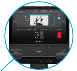
CARDIO 360™ a guided workout to engage the upper, core, and lower body with varying resistance. Upper-Body only option