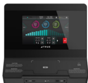
UNITE 10" TOUCHSCREEN