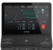
UNITE 16" TOUCHSCREEN