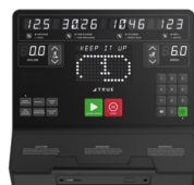
UNITE LED CONSOLE