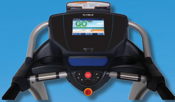
Transcend 9 Touch Screen Console