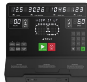
UNITE LED LED CONSOLE