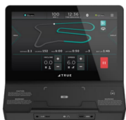
UNITE 16" TOUCHSCREEN