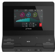
UNITE 10" TOUCHSCREEN