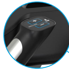
Easy-access quick-touch keys